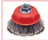
KNOTTED CUP WITH GUARD

High-impact cutting and cleaning on more demanding applications such as heavy deburring, weld cleaning and cleaning larger surfaces. Use Double Row Knotted Cup brushes for heavy-duty, aggressive action in very severe applications.