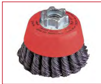
KNOTTED CUP – STEEL