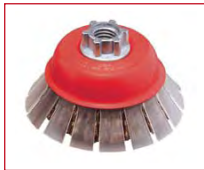
CRIMPED CUT WITH GUARD