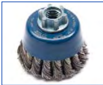
KNOTTED CUP – STAINLESS