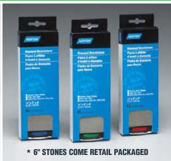
* 6" STONES COME RETAIL PACKAGED