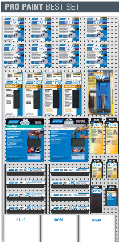
Set dimensions: 30" wide x 60" high