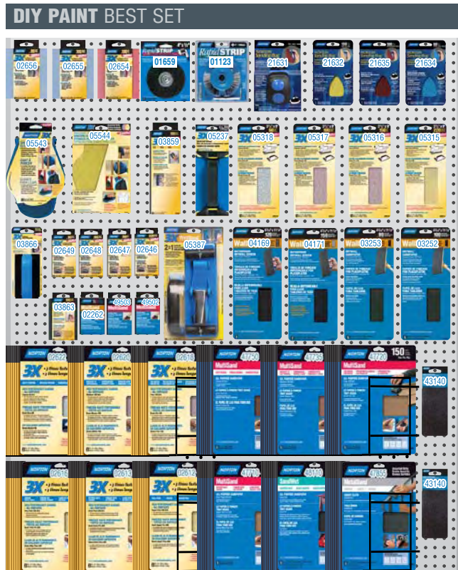
Set dimensions: 48" wide x 60" high

While end-users count on Norton for innovative and affordable product leadership, retailers rely on Norton merchandising for high impact at point-of-sale. As an abrasive category manager attuned to the retailer's needs, the Norton brand provides the opportunity for a high profit per square foot, with minimal investment or risk. Throughout these pages, we showcase key "best sets." These offer a starting blueprint of the best selling products for the category in an easy-to-shop layout to help visualize Norton right in the aisle. From smaller sets for paint, hardware stores and mass merchandisers to the industry's largest selection for warehouse home centers, Norton delivers performance.