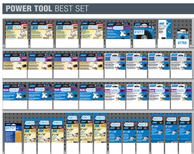
Set dimensions: 48" wide x 36" high