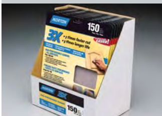
Self-Merchandising Display Case For merchandising flexibility and restocking efficiency.