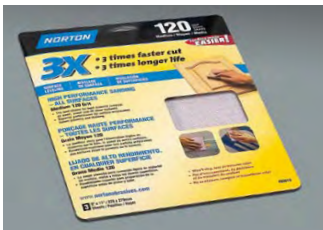
Handy Pack For the do-it-yourselfer.