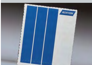
Bulk For the large contractor or for the retailer who wants single sheet selling.