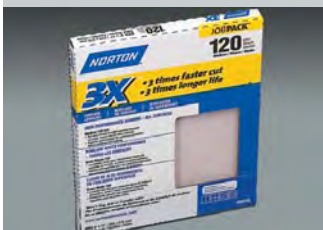
Job Pack For the professional contractor or serious do-it-yourselfer.