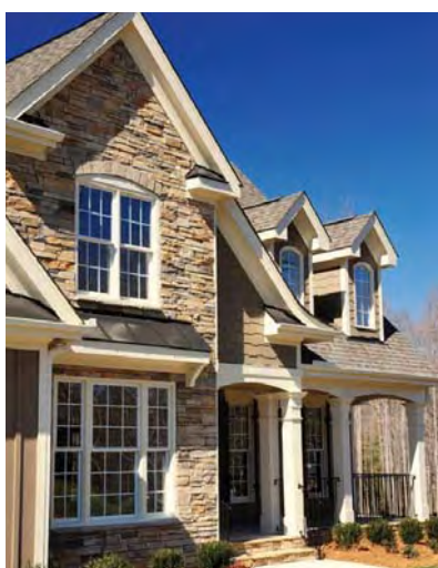
Product solutions for everyday home improvement projects to contractor renovations.